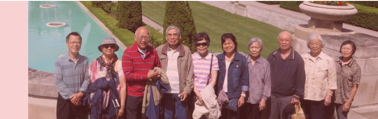
2015 Annual Report